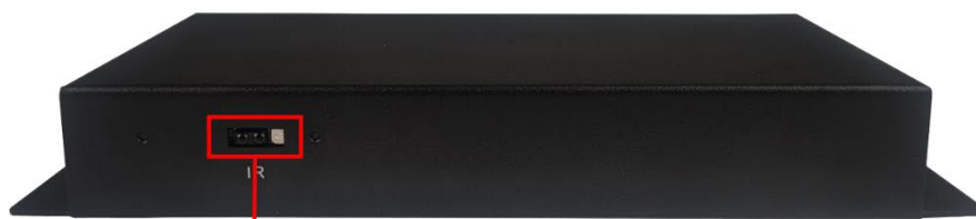
IR remote control receiver